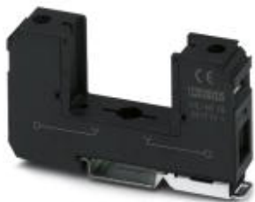
Base element for type 2 arresters of the VALVETRAB MS series of products. Design: 1-channel

Please be informed that the data shown in this PDF Document is generated from our Online Catalog. Please find the complete data in the user's documentation. Our General Terms of Use for Downloads are valid ( http://phoenixcontact.com/download )